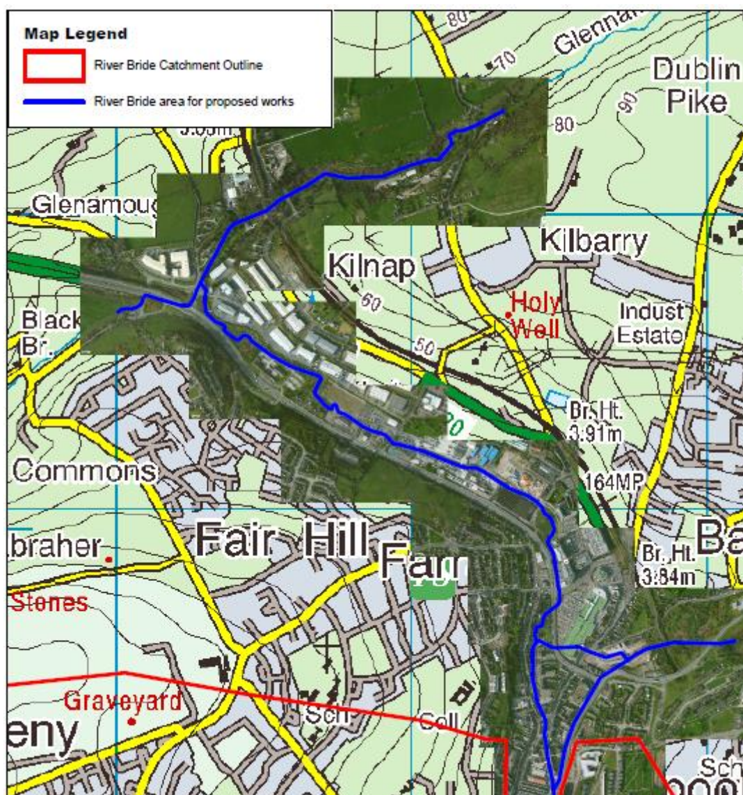
Figure 2 River Bride and Glenamought Rivers

The Grid Reference co-ordinates for the approximate centre of the catchment study area are E168,000 N76,000. The land within the Study Area falls generally towards the river Bride and its tributaries, the